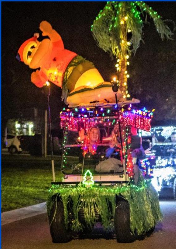
2nd Place: #1 Happy Hula-Days The Joyners