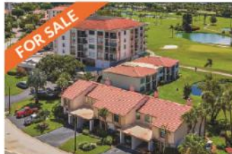
6260 #4 Sun Blvd Isla del Sol 3 Bed | 3 Bath | 1,650 SF Last Listed @ $539,000