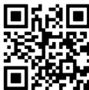
2021 Event Photos

Email aliciajoyner727@gmail.com to be notified for entry into the 2022 Golf Cart Parade. View and download photos and videos at www.broadwaterfl.org or scan code to go directly to link.