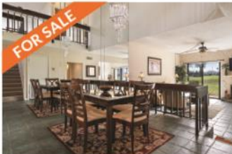
6140 #7 Sun Blvd Isla del Sol 2 Bed | 3 Bath | 1,650 SF Last Listed @ $560,000