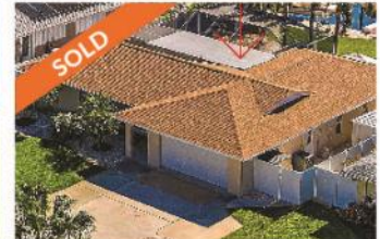
4200 46th Ave S Broadwater 3 Bed | 2 Bath | 1,715 SF Last Listed @ $1,425,000