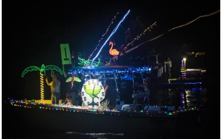
2nd Place: #1 It's 5 O'clock Everywhere John Sackett & Crew