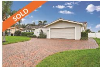
4364 44th Street S Broadwater 3 Bed | 2 Bath | 2,181 SF Last Listed @ $1,149,000